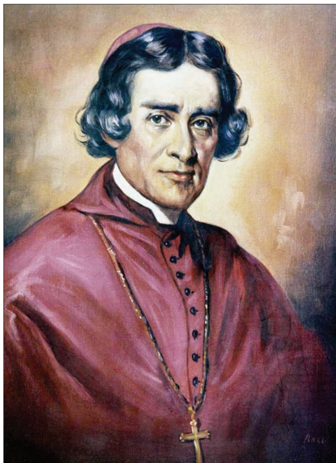
A FUTURE SAINT AMONG US? - The cause for beatification of Bishop Frederic Baraga continues to march forward after a recent decision in Rome.